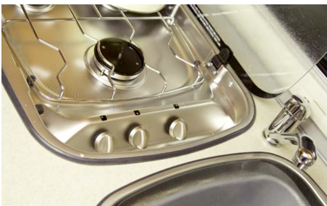
Beautifully practical, simply stylish and virtually indestructible glass hob and sink covers

Set off on your own adventure and you'll soon discover this is a caravan engineered for the road. Light and responsive, the Odyssey will cruise the motorway as effortlessly as it handles those demanding B roads which often lead to the most idyllic caravan sites. The BPW Swing V-Tec chassis allied to Winterhoff's WS3000 stabiliser really add a new dimension to the experience of touring. Once you've arrived it's time to get down to the serious business of relaxation. Unhitch, stabilise, hook up and in minutes you've got your feet up, luxuriating in a world of your own.