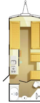
New single axle