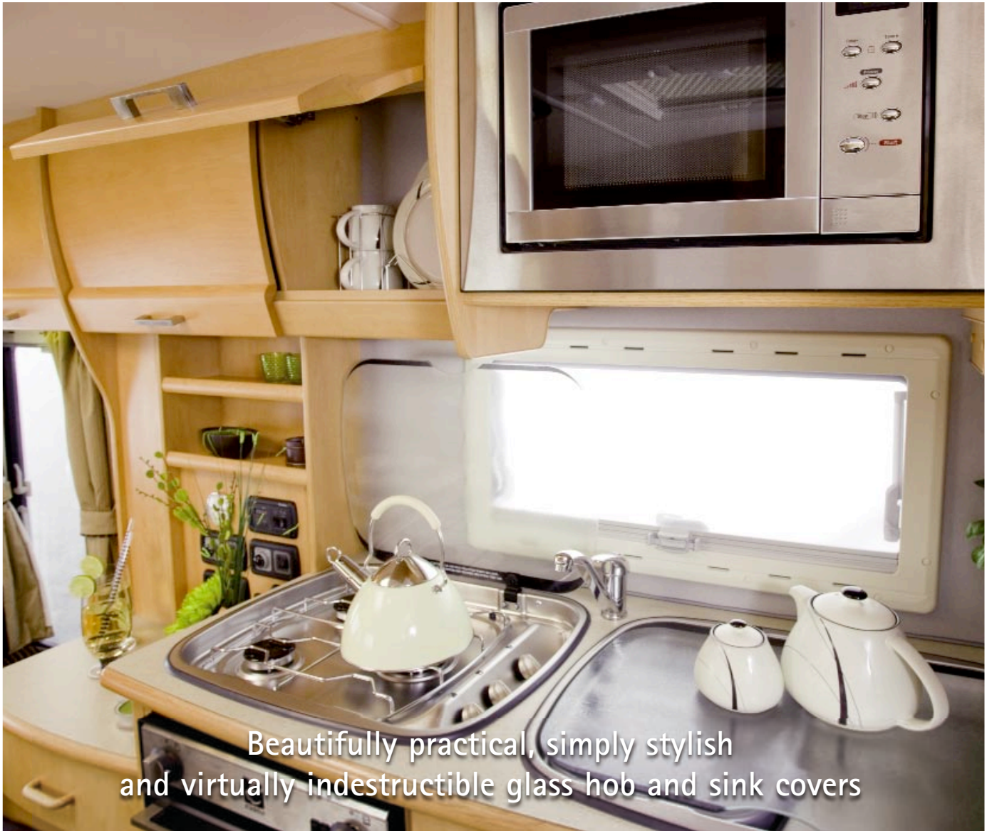
Beautifully practical, simply stylish and virtually indestructible glass hob and sink covers

precious extra preparation space is created by the virtually indestructible heat-resistant 'Chinchilla' glass hob and sink covers which double up as chopping boards. And as things warm up, chill out with the Dometic air conditioning option or turn down the standard mood lighting and simply sink into the leather sofa (option on fixed bed models).