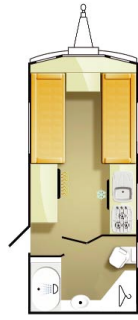
New single axle