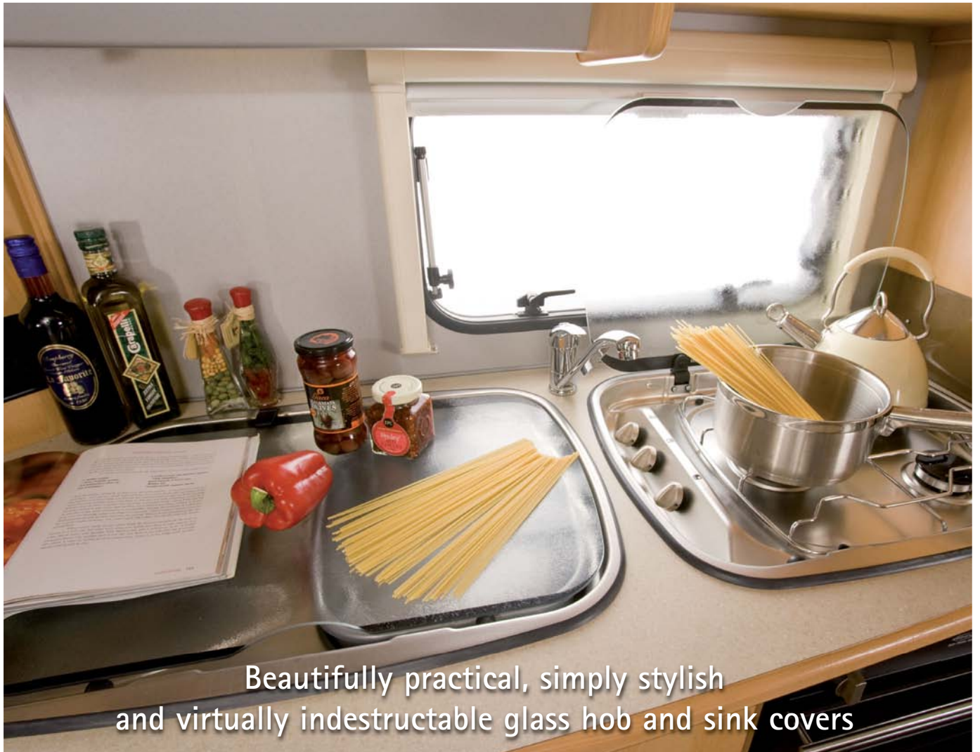
Beautifully practical, simply stylish and virtually indestructible glass hob and sink covers

We build on tradition, with the latest cutting-edge advancements. On the road it's technology and engineering you need to handle those long journeys mixing motorway and by-way. Light and agile, the Avanté Club's road holding comes thanks to a BPW Swing V-Tec chassis which is stabilised by Winterhoff's WS3000. It all adds up to a touring experience, which begins on the road and ends effortlessly at your dream location. Unhitching, hooking up and winding down the big foot stabilising legs takes only a few minutes - so you can put your feet up and stretch out with your favourite tipple.