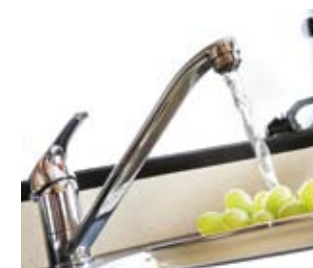
Reliable high performance water supply