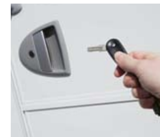
High security lock with automotive style flipper key