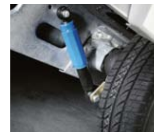
Shock absorbers give more stable, smooth towing