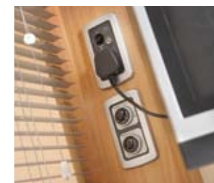
Three mains sockets and two TV points