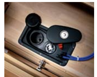
40 litre underfloor insulated water tank (twin axles only)