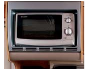
Built-in microwave oven