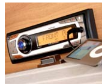
Radio/CD/MP3 player with iPod/MP3 player connection