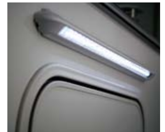
LED awning light provides energy efficient outside lighting